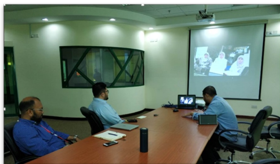
Video conference between UBD and Halal Food Control Division

The meeting provided UBD with an insight into the role of Halal Food Control Division and information on stakeholders in the Halal food industry in Brunei. UBD hopes to move forward with different industries to make the research and development activities at UBD to be more in line with Wawasan 2035.