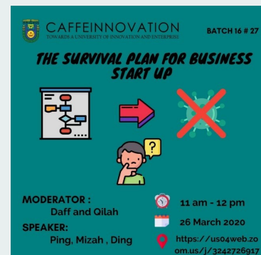
The First Online Caffeinnovation Poster

The idea of an online platform fits with the university's effort in implementing online learning and teaching over the years. It is also hoped that by putting the Caffeinnovation platform online, it can help students within and outside of UBD to share and explore entrepreneurship experiences with each other.