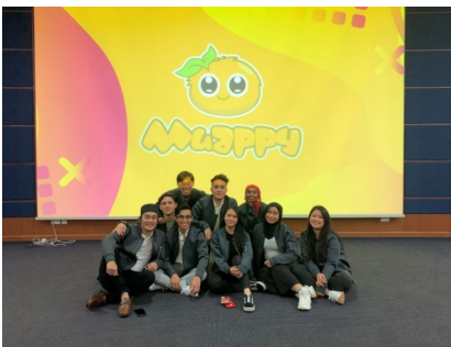
Muappy Team, a USC alumni startup with their members of multi-disciplinary backgrounds

For the launch, Muappy has invited a total of 30 vendors and partners that have joined the app to attend. The vendors that had joined the app comes from industries such as Food and Beverage, Fashion, Textile, Desserts, Cafes, Car Detailing, Accommodation, Games, and Fitness Studios. The app launched as a Beta to get feedback from the public to further improve the application.