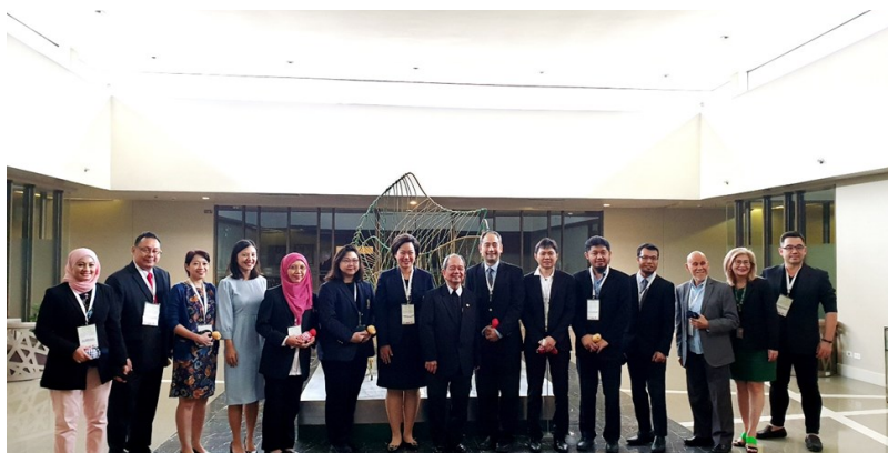
Group photo with representatives from various universities under AUN, during the meeting.

E-mail of contact person: emeroylariffion.abas@ubd.edu.bn