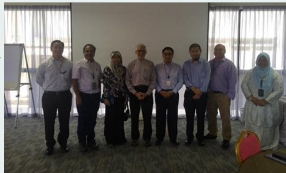
Group photo with representatives from BSP