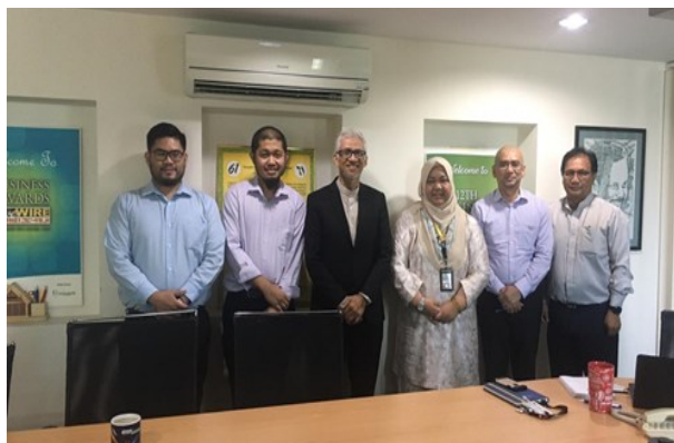
Group photo with representatives from LiveWIRE

Shell LiveWIRE Brunei is Brunei Shell Petroleum's flagship enterprise development programme with the objective to strengthen local economies. Some of LiveWIRE's objectives focuses on developing entrepreneurial culture, skills and knowledge and providing access to finance, market linkages, technology and mentoring to local business.