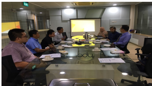
Industry Engagement with LSL Sdn Bhd

LSL are committed to building quality infrastructure projects with their highly experienced team that focuses on delivering quality service and effective construction planning. They are also proudly known for locally manufacturing a wide range of high quality products.