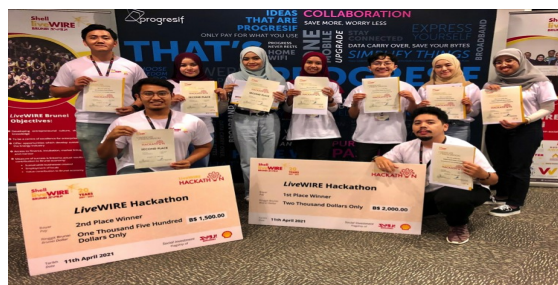
Group photo with students in the Shell LiveWIRE Hackathon

Between 9th and 12th April 2021, seven out of ten students from the Discovery Year Incubation Program under EV had the opportunity to participate in the LiveWire Hackathon event, organized by Brunei Shell LiveWIRE Sdn. Bhd.