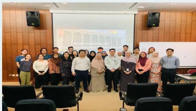
Group photo with Brunei Intellectual Property Office