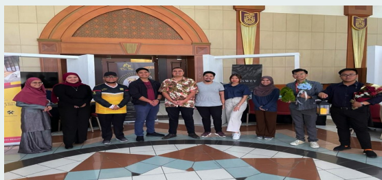
Group photo with EV Startups during showcase

These incubate had undergone training as 'student entrepreneurs' under the Discovery Year Incubation program, and alumni startups under USC. During the showcase, they showcased their promotional products and services. This was also an extension to show the UBD Entrepreneurship Ecosystem, where multidisciplinary collaboration plays a role in ensuring innovation and sustainability. This is the first time that the event has been organized, and it is planned to be held annually; to provide a platform to proudly expose and present startups that have been trained at UBD.