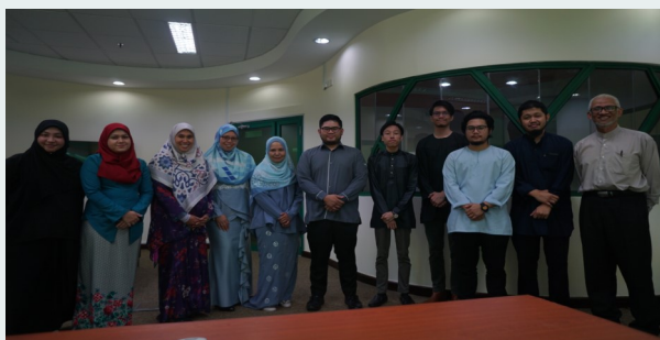
Group photo with internship students