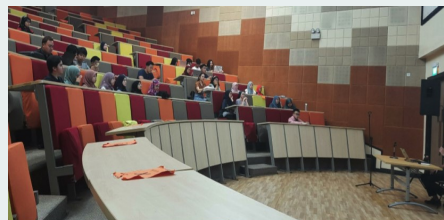
BigBwn Go Digital Workshop for Discovery Year( DY) Incubation

On Thursday, 1 st April 2021, students from the Discovery Year Incubation program of the Entrepreneurship Village (EV) had the opportunity to attend a workshop organised by BigBWN, called GO DIGITAL ASEAN, which took place at the Main Lecture Theatre, Level 2, Institute of Health Science (IHS) Extension Building, at UBD