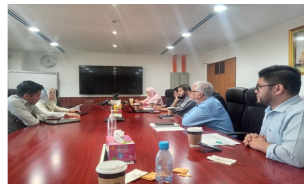
Meeting with Imagine Sdn Bhd

Imagine Sdn.Bhd is a well-known telecommunication company in Brunei. Their vision is to be a force of transformation in Brunei, by helping to accelerate people and businesses into the future; by empowering every resident in Brunei to imagine, create and experience the future through next-gen telecom solutions.