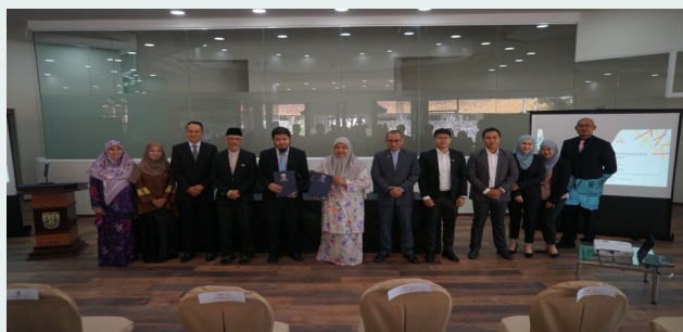
Group photo between UBD and Shell Livewire Sdn Bhd

On Saturday, 19th June 2021, Shell LiveWIRE Sdn Bhd and OAVCIE, UBD signed a memorandum of understanding ( MOU) at the UBD Startup Centre (USC) in UBD. The MOU provides a general framework of cooperation and collaboration, as well as the initiation of a working relationship in different areas of mutual interest between UBD and Shell LiveWIRE. Particularly, both organizations are looking to enhance and channel student startups under the university's entrepreneurial initiatives with extended exposure to entrepreneurial education and intellectual property rights awareness. This MOU also acts as a platform for joint or collaborative research in fields of mutual interests between UBD and Shell LiveWIRE. To further encourage and support the production of students with an entrepreneurial mindset, Shell LiveWIRE also accommodates UBD students for durational industrial attachment and placement in areas mutually agreed by both organizations.