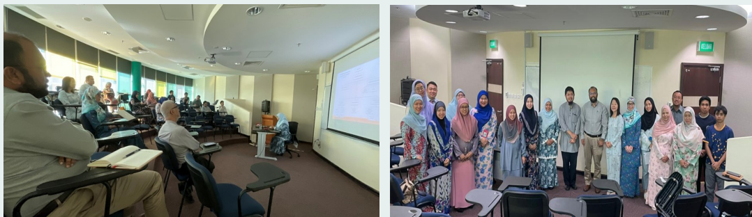
Group photo With The Department Of Scientific Services , MOH