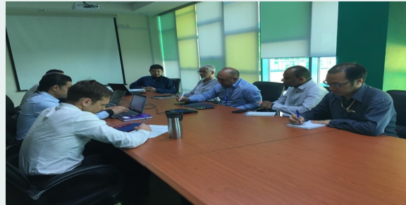
Meeting between BSP Decommissioning And Restoration Team

On 27 th May 2021, A representative from Brunei Shell Petroleum (BSP) Decommissioning and Restoration (D&R) Team had a discussion on Surface Abandonment-Isolation Strategy with the Office of Assistant Vice Chancellor Innovation and Enterprise (OAVCIE).