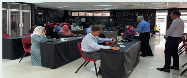
Discussion Photo Of Faculty Representative Entrepreneurship Development