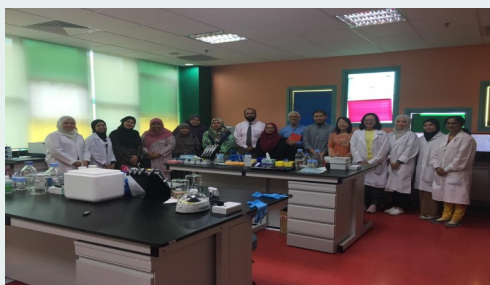
Group photo with DSS working group

DSS is responsible for providing laboratory services through comprehensive scientific analysis and calibration to support public health and law enforcement agencies in Brunei Darussalam. The department is capable of providing such scientific analytical services and calibration services, in line with current developments in the fields of health science, forensic science, metrology, and in assisting to fulfill food export requirements.